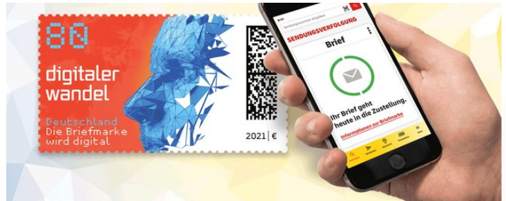
Fig 2. The Post & DHL app

Initially, only some stamps will bear the code, with a start date of February 2021. From 2022, all stamps will bear the code. The codes are included in the stamp at the printing stage. The code is made up of: