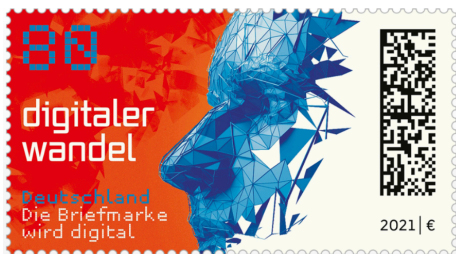
Fig 1. The new stamp reading 'digital change' and with a QR tracking code.

Starting February 2021, new issues of German stamps (Fig. 1) will feature a matrix code. On the one hand, it is intended to prevent counterfeits or fraudulent multiple use. Furthermore, use of the code will also allow shipment recording and control and tracking, as well as detailed background information about the stamp. The codes, which are similar to QR codes, will sit alongside the traditional images in what will be “a new generation of stamp.” The code allows for more than four billion numbers within to obtain a unique identifier for each stamp. For philatelists and interested customers, an additional benefit is that detailed background information about the respective stamp is available using the Post & DHL app of Deutsche Post via the matrix code (Fig. 2).