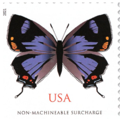
Fig. 1 The nondenominated (75¢) Colorado Hairstreak Butterfly Stamp issued March 9 in a pane of 20

Like the more familiar forever stamp, the nonmachineable surcharge rate stamp (Fig. 1) continues to fulfill the designated rate even if the nonmachineable rate increases in the future.