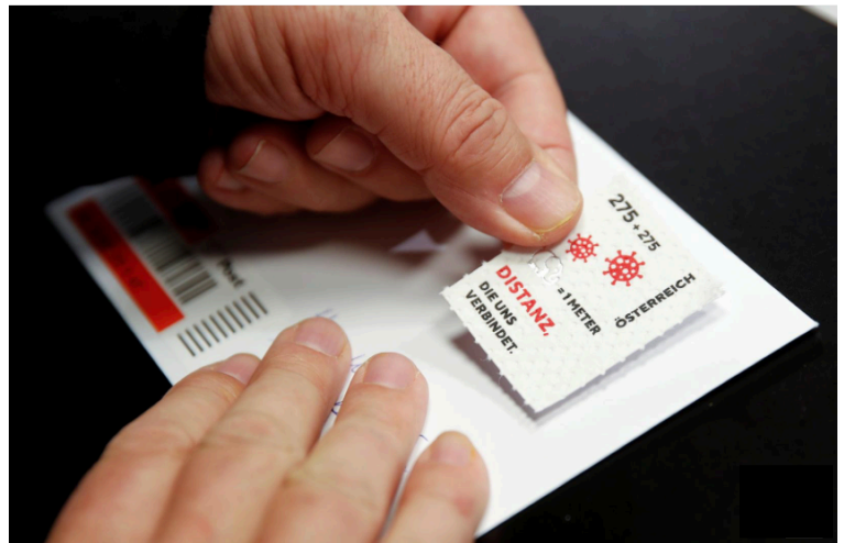
Fig 1. Austria 2020 Distance that Brings Us Together Semi-Postal Toilet Paper Stamp