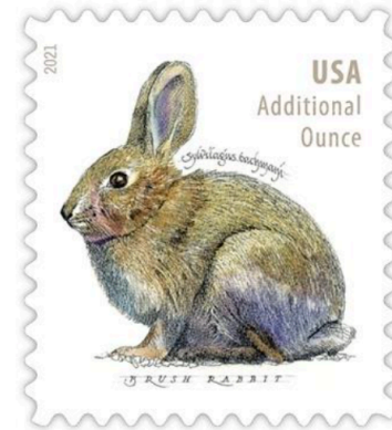
Fig. 1 The additional ounce (20¢) Brush Rabbit Stamp issued January 24 in a pane of 20

The Brush Rabbit stamp (Fig. 1) covers the new additional ounce postage for first-class mail, which rose from 15 cents to 20 cents on January 24, the day the stamp was issued.