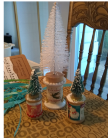
Fig. 3. Decorating a Christmas tree using old thread spools and postage stamps

Finally, what better way to decorate a Christmas tree display using old thread spools with some postage stamps (Figure 3).