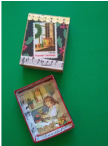
Fig. 1. Matchbox using postage stamps and christmas seals.

Consider, for example, a simple matchbox using old papers. What better way to decorate than using postage stamps and Christmas seals (Figure 1).