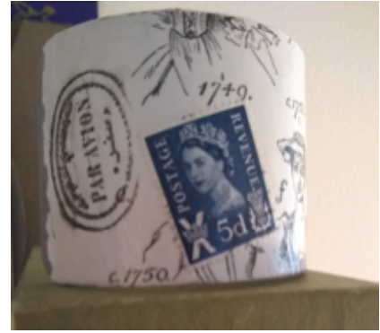
Fig. 2. Decorating a cuff bracelet using a postage stamp

Finally, what better way to decorate a Christmas tree display using old thread spools with some postage stamps (Figure 3).