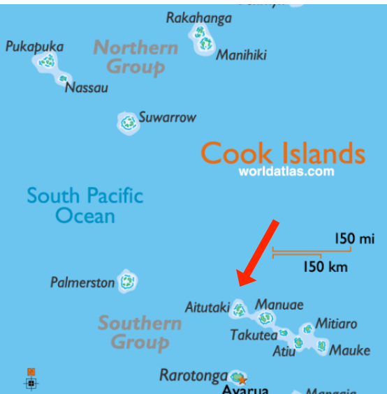
Fig. 1. Map of Cook Islands. Arrow points to Aitutaki

With a vast, sparkling lagoon rivaling Bora Bora's – but with a fraction of the visitors – Aitutaki just might be the world's most beautifully-remote island. Just a 45-minute flight from the main island of Rarotonga in the Cook Islands,