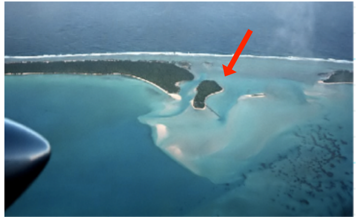
Fig. 2. View of One Foot Island

Aitutaki and its surrounding 22 atolls serves as the tropical backdrop for "Survivor: Cook Islands." Encircled by a knee-high lagoon, One Foot Island Aitutaki (or Tapuaetai, "one footprint") is both exotic and nearly deserted. But while it may look totally deserted, this tiny island paradise is home to one top attraction – a small hut containing the One Foot Island Post Office, one of the world's most remote. Unfortunately, the Post Office is open only during the times a cruise ship stops by.