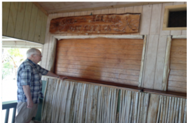
Fig. 3. One Foot Island Post Office