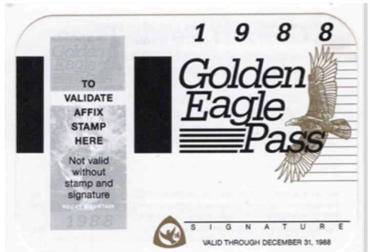
Fig 2. The Golden Eagle Pass

Problems with the the issue format caused the stamp program to be terminated after 1998. National Park stamps, in a similar format but with a 10$ face value, were issued for nine more years from 1989 to 1997. While all ten stamps could be collected as a series, the 10$ stamps were not federal revenue stamps. Such stamps on available on ebay or from stamp dealers or other collectors.