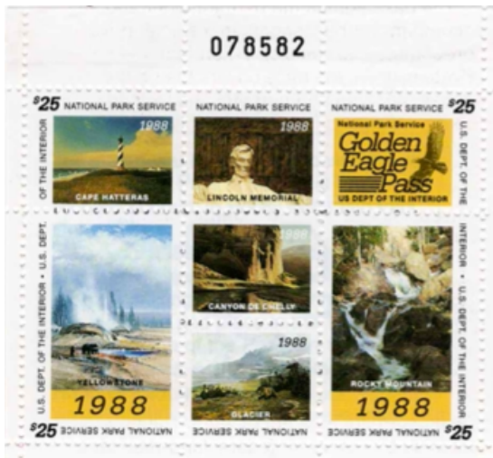
Fig 1. The Golden Eagle Pass Stamp.

The Golden Eagle Pass was validated by attaching the right-hand portion of the National Park Stamp and affixing it in the space indicated and signing the card.