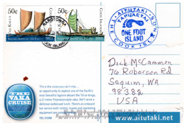
Fig. 4. Post Card with One Foot Island Passport Stamp