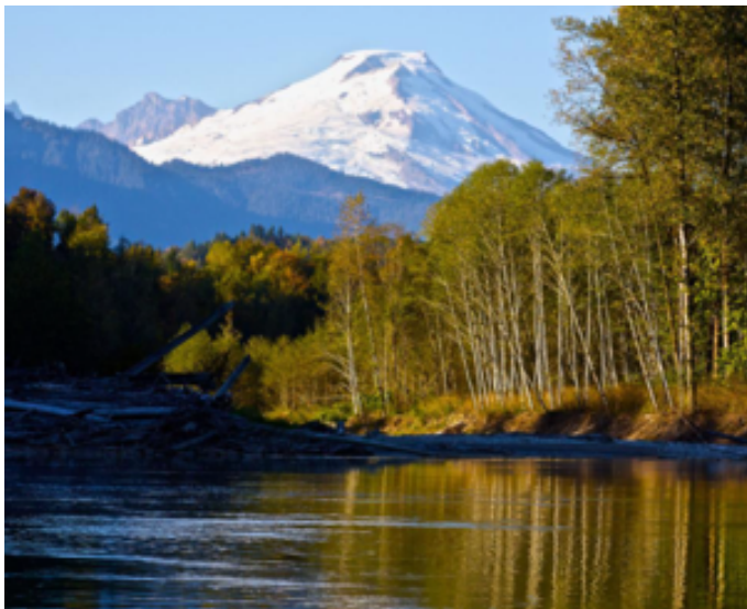
will be used on a stamp featuring the Skagit River