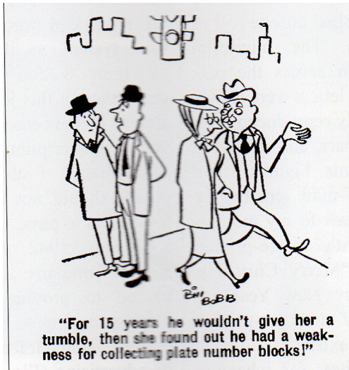
From ASDA & Stamp Collector News