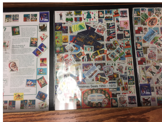
A part of the display

Anyone who has found themselves waiting in line at the Post Office here in Sequim is in for a treat. Don McIntyre (aka Santa) has put together a display that will be up during the holiday season. The display (see below) is made up of a montage of items such as Christmas seals, religious stamps and posters and all manner of other ephemera. The display extends a distance of 10 feet. It is an excuse to make a special trip to the Post Office.