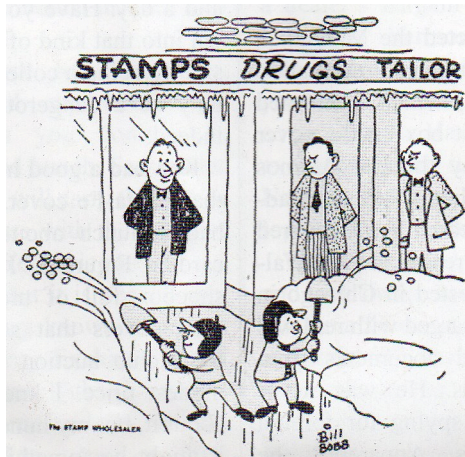
From ASDA & Stamp Collector News